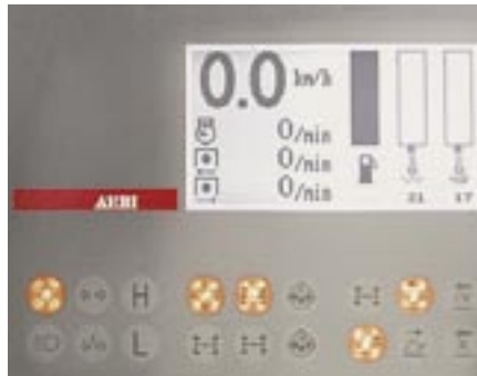
On the keyboard to the right next to the lever, the driver can operate the electronics menu, which is displayed on the screen (in one of four possible languages). Values critical to the operating state are immediately and clearly displayed on the screen.