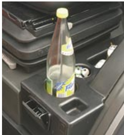
The practical details: ashtray, drinks holder, small compartments to hold loose objects, etc.