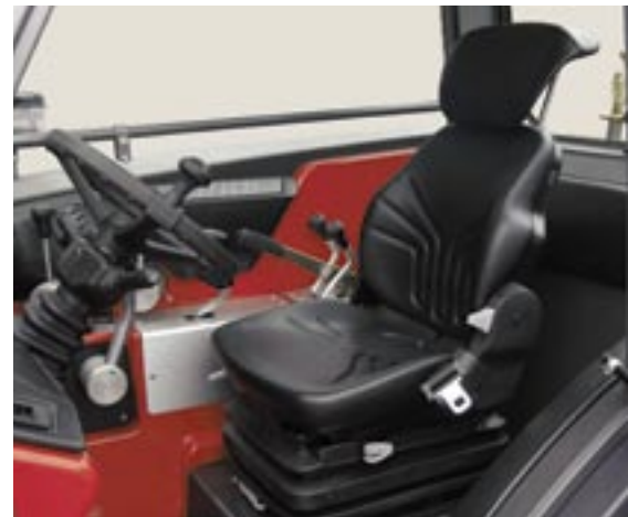
The sprung drivers seat has a range of positions and (as an option) can be tilted for working on slopes.