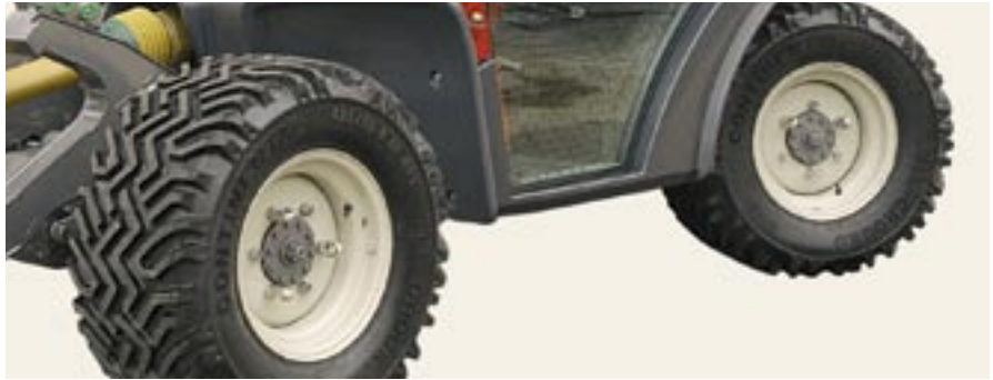
True rear-wheel steering for precise working with front-mounted equipment.