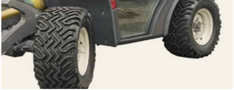
Front-wheel steering for normal operation.

To improve safety and economical use on steeply sloping ground, the TT170 is fitted with the new "All Ground" radial tyres. They can be supplemented with dual tyres at the front and rear. With a 40-degree steering lock at front and rear (30 degrees with dual tyres) this Terratrac is extremely manoeuvrable in all situations.