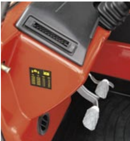
The heating outlets and the (optional) air conditioning.