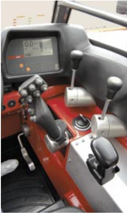
Up to 21 functions can be carried out on the multifunction control lever, some of them 'blind', without changing hands.