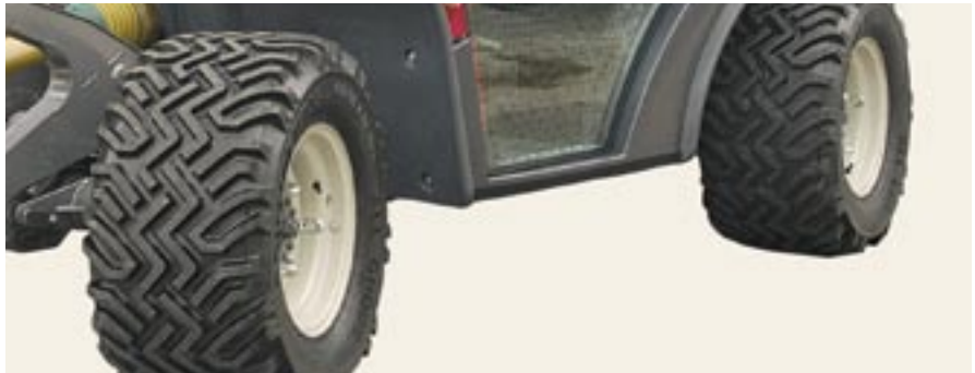
Crabsteering for special conditions on a slope.