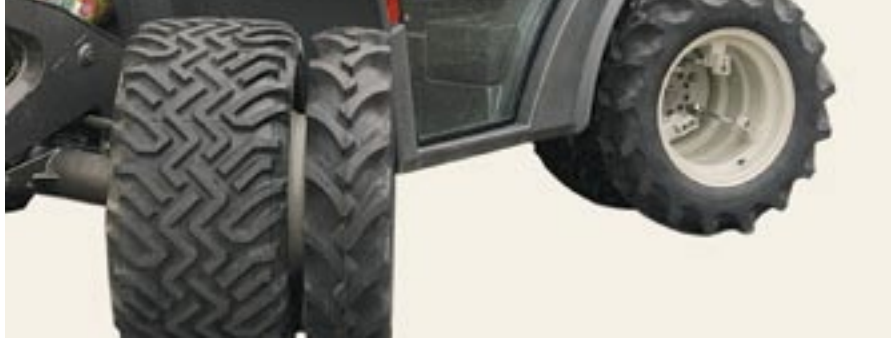
Four-wheel steering for tight turning radii and for turning quickly.

Turf tyres for upkeep of grassed areas without damaging the ground.