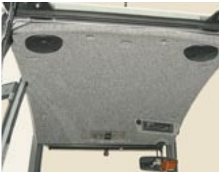
Cab roof with built-in radio and loudspeakers.