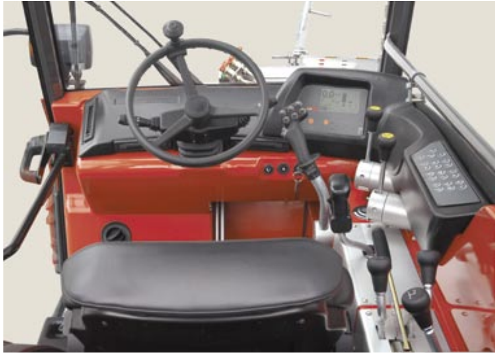
Thanks to the clear layout of all operator controls, the driver is always fully in charge of the TT170. The central electronic system displays the current operating state on a large screen and via indicator lights.