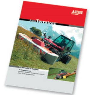
In the Terratrak general brochure, you can read all about the Terratrak operating concept, the application of state-of-the-art electronics and the unrivalled automated features.

External push-buttons allow easy operation of the front and rear hydraulic lifts for fitting attachments. The front hydraulic lift can be moved to the side. At the rear, there is also a height-adjustable trailer coupling.