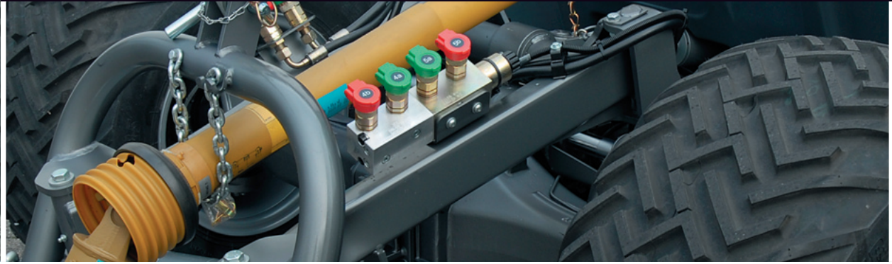
Hydraulic connectors on the front hydraulic lift