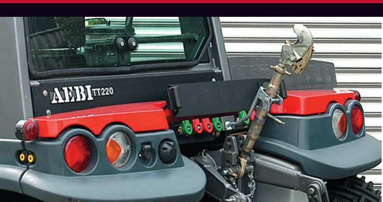
Strength and pulling power at the rear