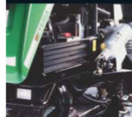
WATERCOOLED 30HP DIESEL ENGINE