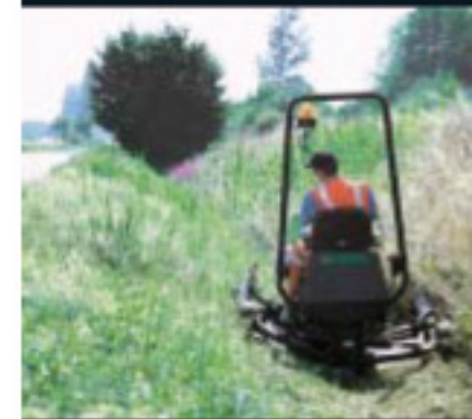
PERFECT FOR GULLEYS