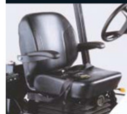
OPERATOR COMFORT AND SAFETY