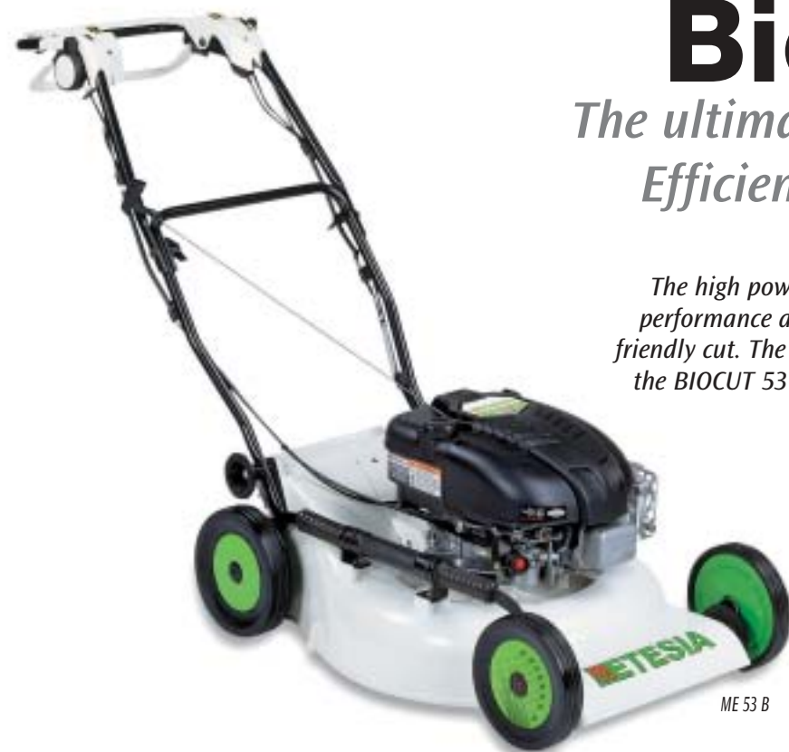
ME 53 B

The high powered mulching mower BIOCUT 53 has high performance and ensures a quick, clean environmentally friendly cut. The mulching cover can be removed to convert the BIOCUT 53 into a direct rear ejection mower, which is highly efficient in tall and wet grass.