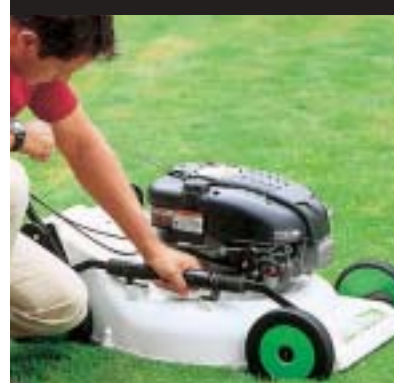
ANY CUTTING HEIGHT BETWEEN 25 AND 95 MM