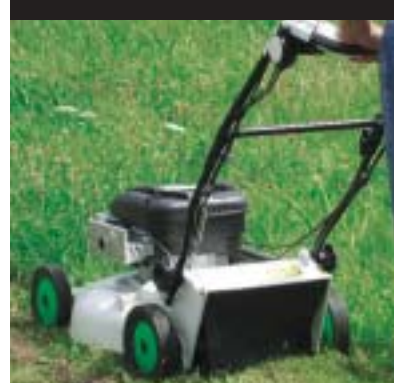
REAR EJECTION IN TALL GRASS