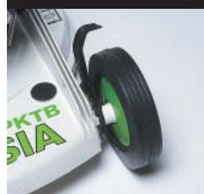
SINGLE LEVER HEIGHT ADJUSTMENT