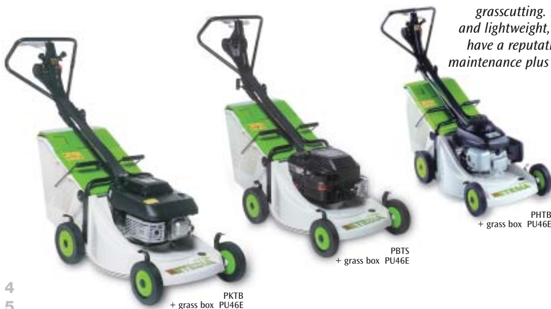
PKTB + grass box PU46E

Designed to meet the rigours of a wide variety of commercial grass cutting applications, ETESIA's Pro 46 pedestrian rotaries are specified by contractors who want to profit from grasscutting. Highly manoeuvrable and lightweight, these rugged mowers have a reputation for reliability, low maintenance plus minimum downtime.