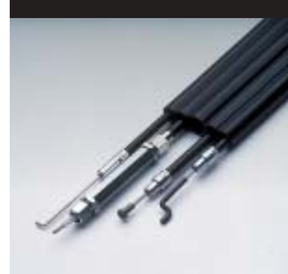
UNIQUE CABLE PROTECTION