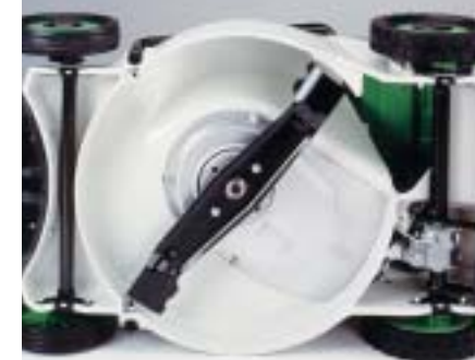
ALUMINIUM CUTTING DECK