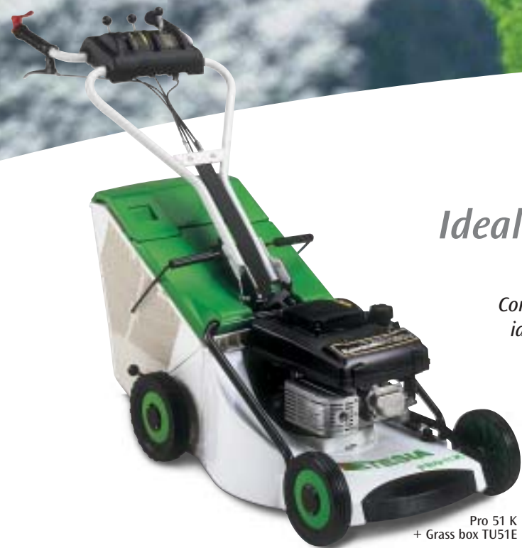
Pro 51 K + Grass box TU51E