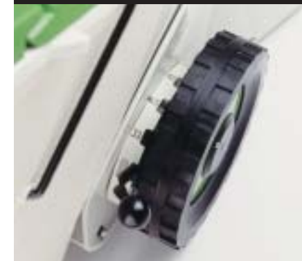
CENTRAL CUTTING HEIGHT ADJUSTMENT