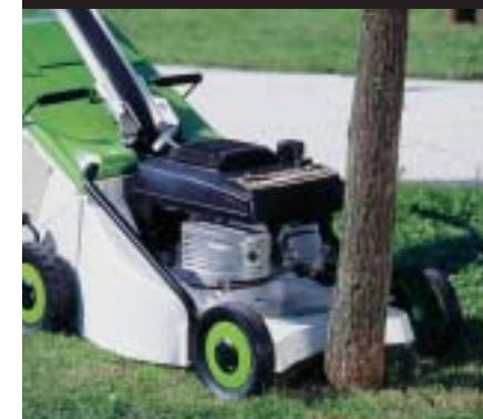
REMOVABLE FRONT BUMPER