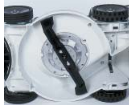
ALUMINIUM CUTTING DECK