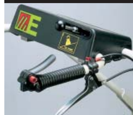
BLADE BRAKE SYSTEM