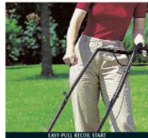
EASY-PULL RECOIL START