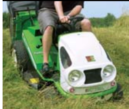
CUTTING AND COLLECTING