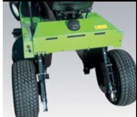
STRADDLE BRIDGE AXLE