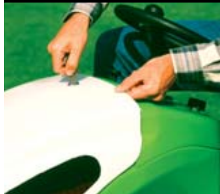
UNLOCKING OF THE BONNET