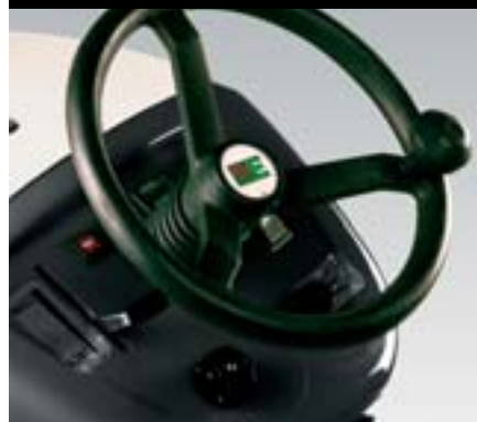
NEW ERGONOMIC DRIVING POSITION