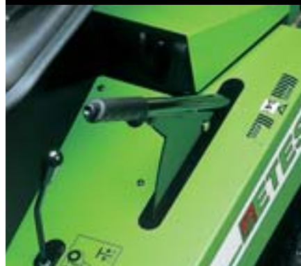
CUTTING HEIGHT ADJUSTMENT