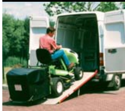
1M CUT GIVES AN OVERALL WIDTH OF 1.04M