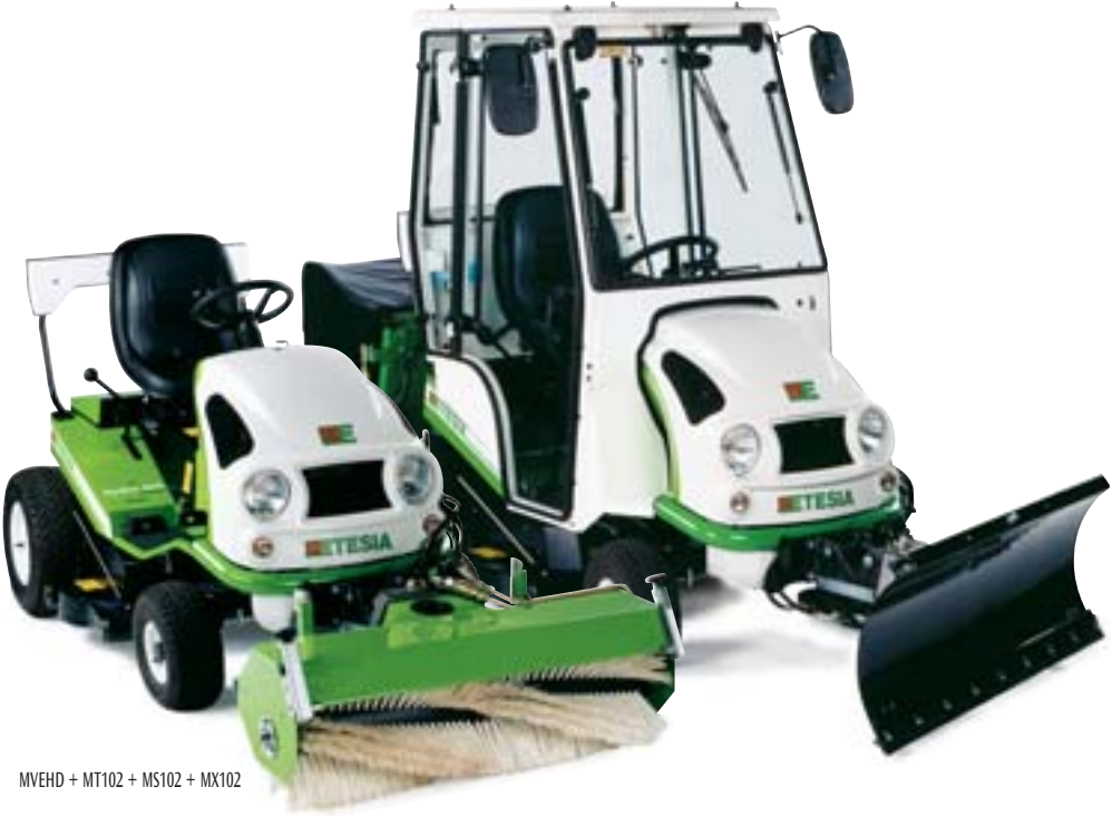
MVEHD + MT102 + MS102 + MX102