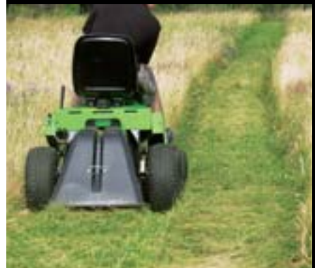
MOWING WITH A DEFLECTOR