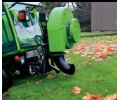
MSF 124 BLOWER