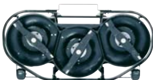
MCM 144 mulching deck

For longer grass or non-collection applications, the MD 124 is fitted in minutes without special tools.