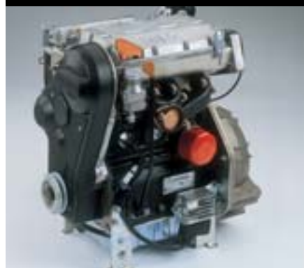
LOMBARDINI FOCS 1003 DIESEL ENGINE