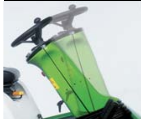
ADJUSTABLE STEERING CONSOLE