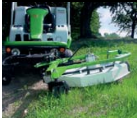
MCF 124 FRONT-MOUNTED CUTTING UNIT

Make your H124DS into a versatile machine with our PTO option enabling you to a range of accessories (also available as a factory fit: OPDF 124).