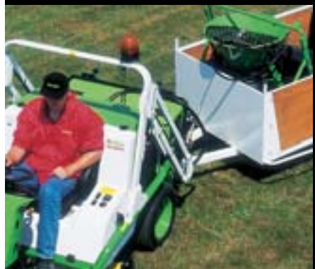
MR 124 TOW BAR