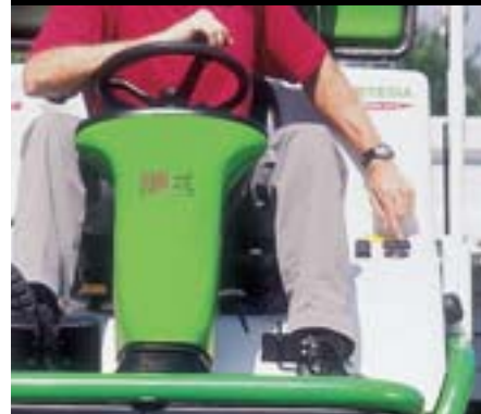
EMPTYING FROM THE OPERATOR'S SEAT