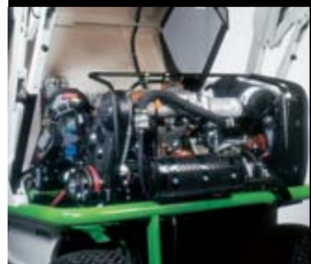
DIRECT ACCESS TO THE ENGINE