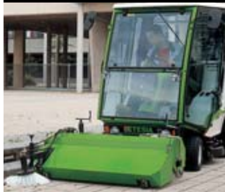
SWEeper WITH BOX AND GUTTER BRUSH