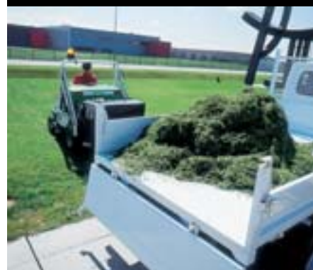
GRASSBOX EMPTYING UP TO 1.80 M HEIGHT (H124D MODEL ONLY)