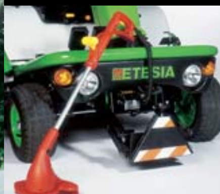
12 VOLTS ELECTRICAL SOCKET