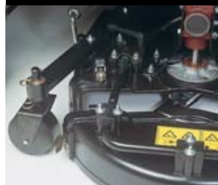
CUTTING DECK REMOVABLE WITHOUT THE USE OF TOOLS (H124D MODEL)