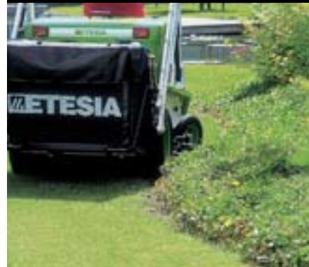
TIGHT TURNING CIRCLE