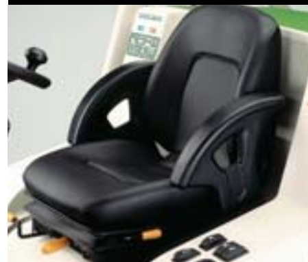
COMFORTABLE SEAT (H124D MODEL)