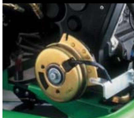
ELECTROMAGNETIC BLADE CLUTCH