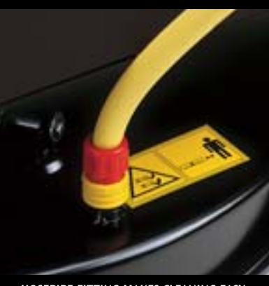
HOSEPIPE FITTING MAKES CLEANING EASY