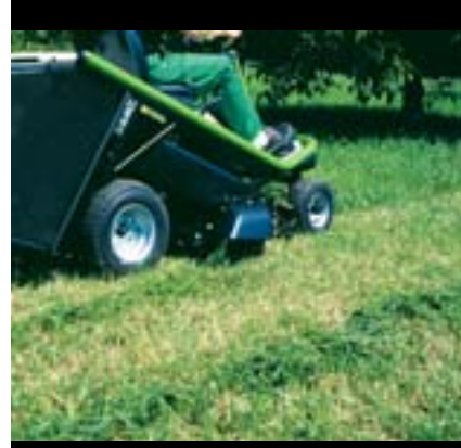
WINDROWS CUT GRASS