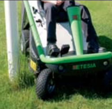
TIGHT TURNING CIRCLE