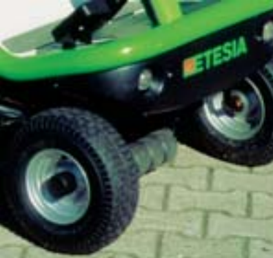
FRONT LIGHTING, LARGE SIZED FRONT WHEELS