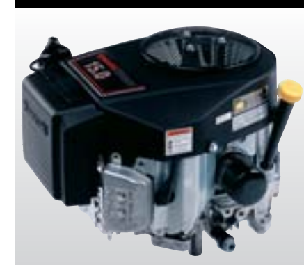
15 HP KAWASAKI TWIN CYLINDER ENGINE