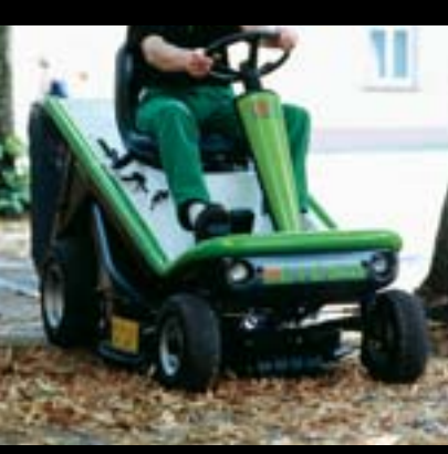
COLLECTS LEAVES AND LITTER