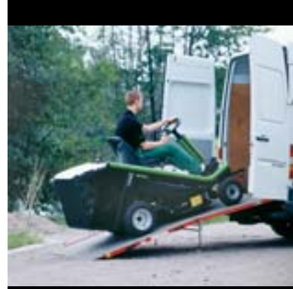
COMPACT AND GO-ANYWHERE