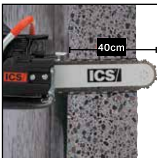
Deep cutting solution for obstructed or small openings