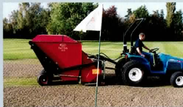
Ideal for collecting cores