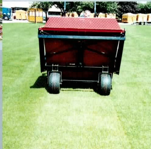
Turf Tidy in operation with scarifying blades

Due to the turbo fan the debris is compressed into the hopper so that the hopper can carry up to double the quantity when compared with others.