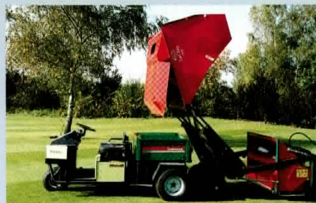
The diagonal highlift of the hopper enables it to empty into trailers.