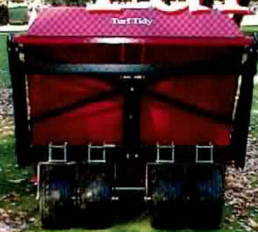
Sweeping with the brush kit